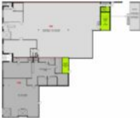
102 / 103