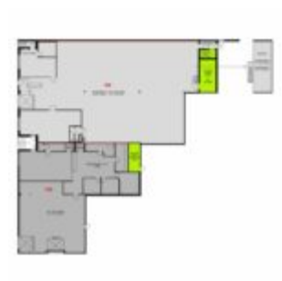
102 / 103